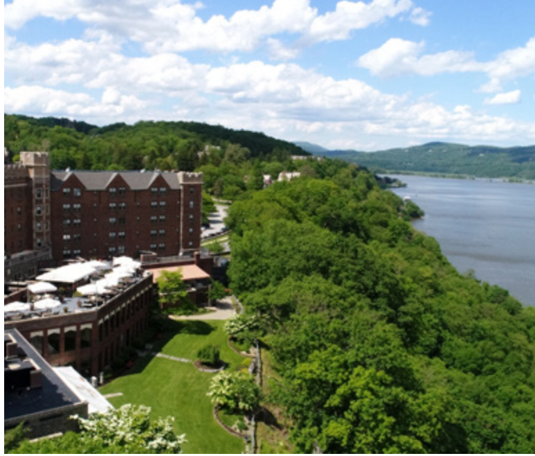
Top left, The Abbey Inn has beautiful river views; Top, amazing scenery at Buttermilk Falls; Above, vistas of West Point and the Hudson River from The Thayer Hotel; Left and far left, the lakeside chalet of the Mohonk Mountain House and a relaxing spot with a view to sit and read a book.