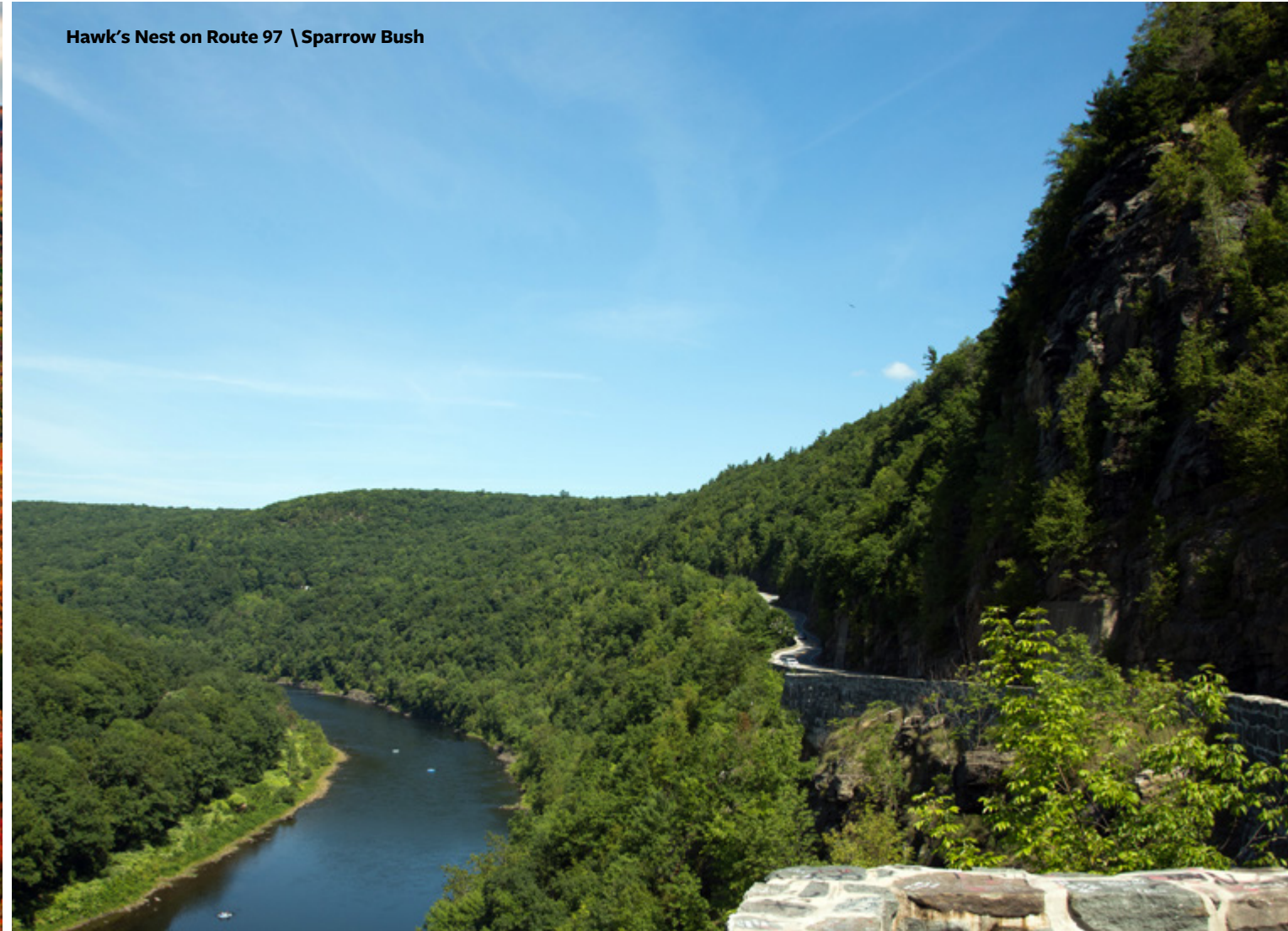
Hawk's Nest on Route 97 | Sparrow Bush

River, connecting the railroad city of Port Jervis to the bluestone village of Hancock—a snake-like portion in Sparrowbush has been featured in many car ads!" says Dana.