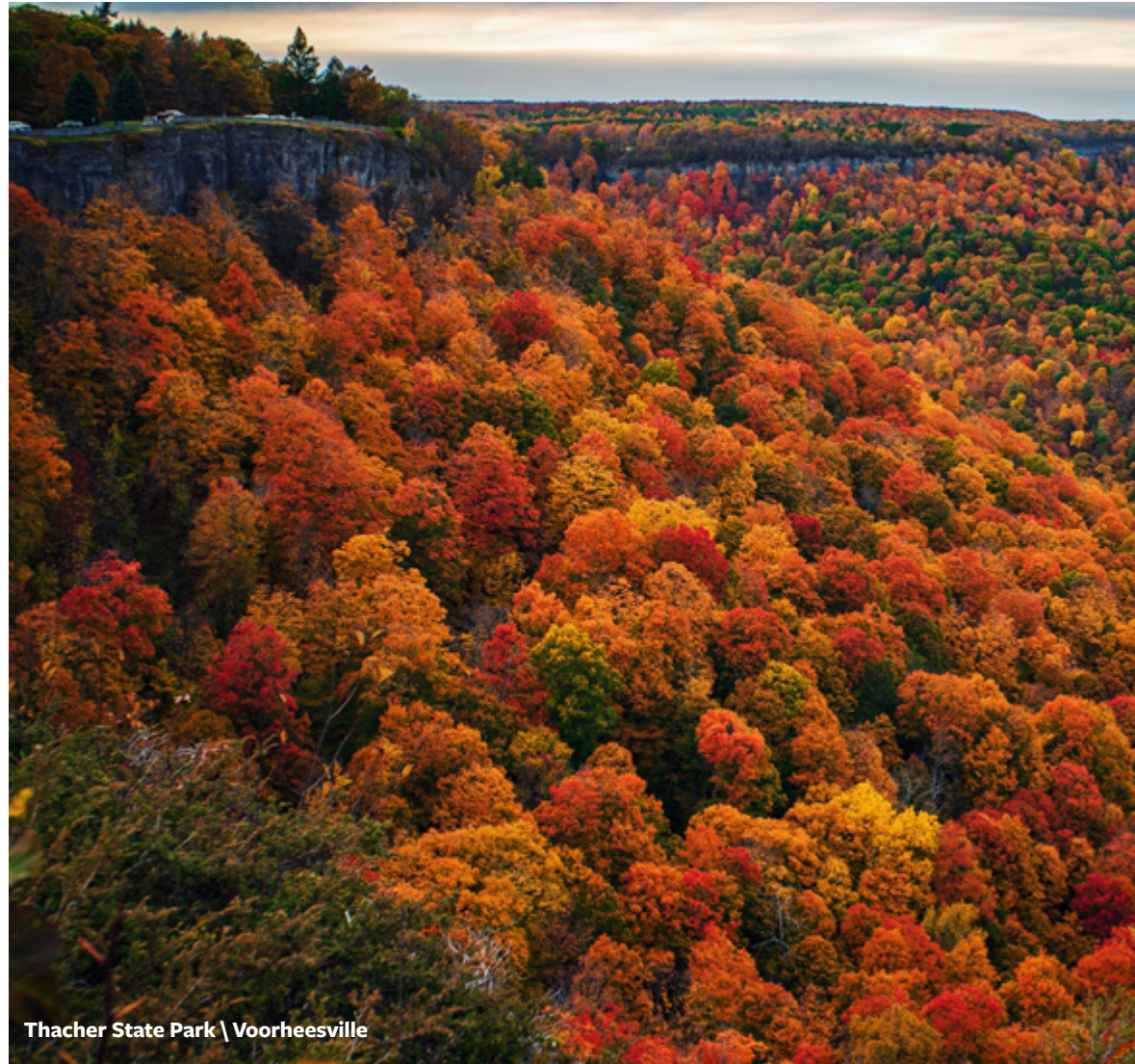
Thacher State Park | Voorheesville

Why it's great: "This unique highway follows the Delaware